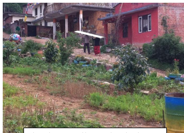
Sheets being carried by a couple to their homes.