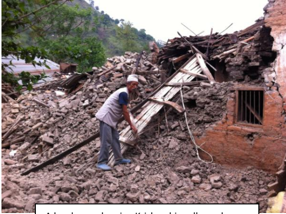
A local man showing Krishna his collapsed house