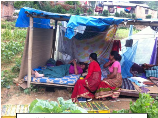
A local lady, Roita, got injured during the second earthquake.