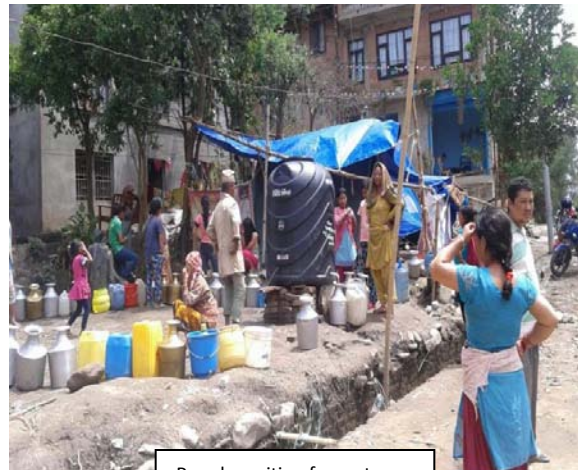
People waiting for water