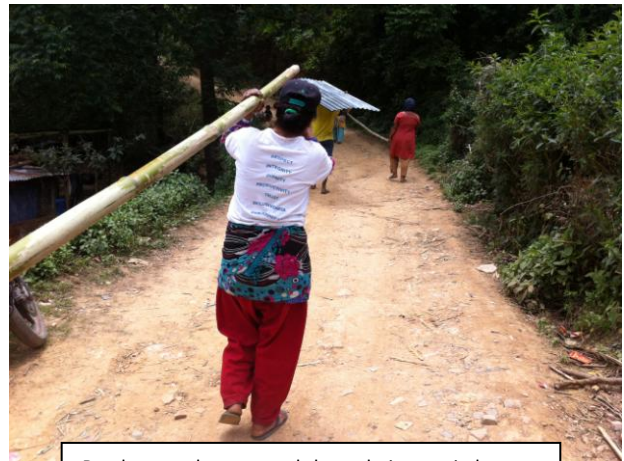
Bamboos and corrugated sheets being carried to Bosan, the village above Khahare.