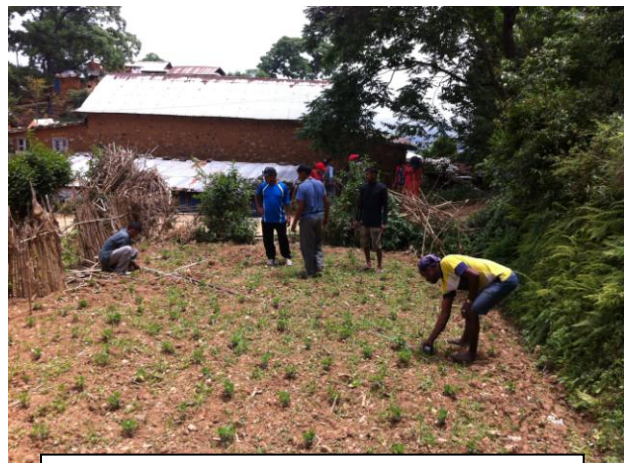
Measurements are being taken before the construction of a new shed.