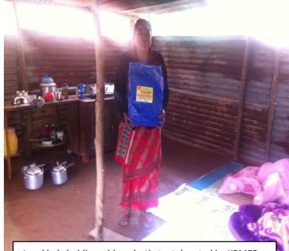
Local lady holding a blue plastic tent donated by KRMEF.