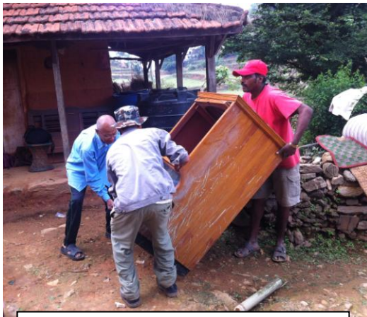
Furniture being moved out of a perilous building