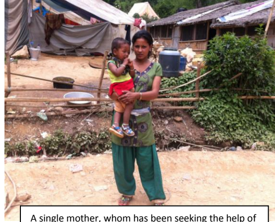
A single mother, whom has been seeking the help of the foundation