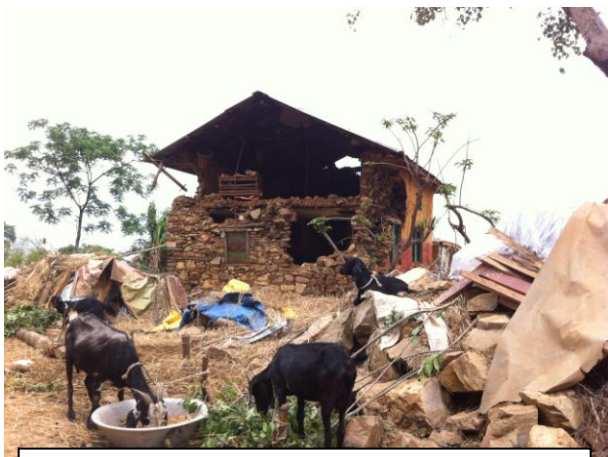
More damages were caused by the earthquake on May 12 th .