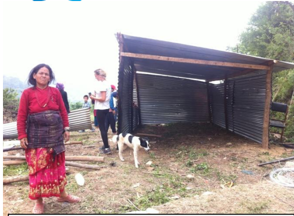
The mother of one of our teachers being grateful for erecting a house on her property for her family of ten members.