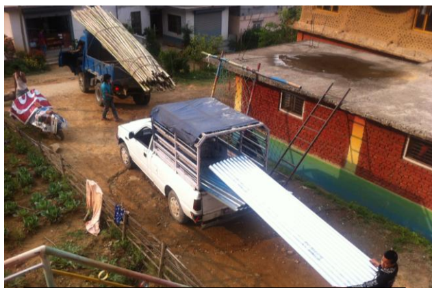
Corrugated sheets and bamboo distribution to the locals.