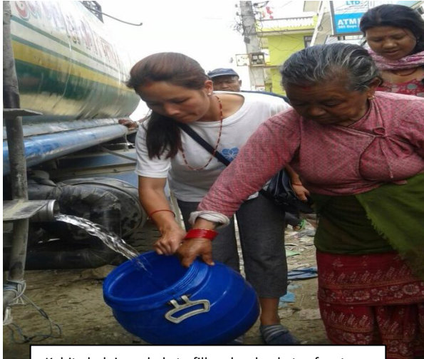
Kabita helping a lady to fill up her buckets of water